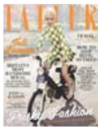
Tatler circ 87,616