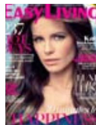
Easy Living circ 158,038