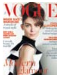
Vogue circ 210,766