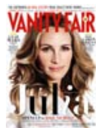
Vanity Fair circ 100,560