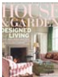
House & Garden circ 127,260